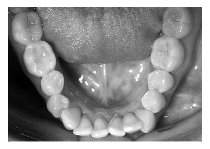
Fig. 1. The lower dental arch crowding is an essential feature of the completed permanent dentition over the age of 17 years

Because of all these contrasting findings this study was started to re-evaluate correlation between the lower third molars presence and lower dental arch crowding.