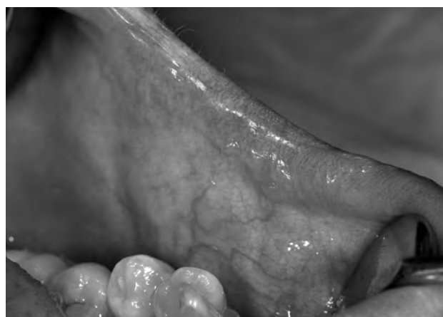
Fig. 4. Patient after treatment